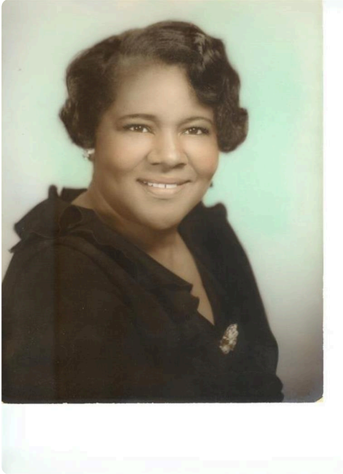
The Grand Diva